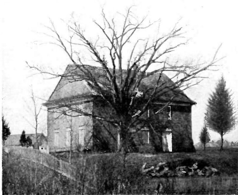
THE PRESBYTERIAN CHURCH OF PITTSGROVE AT DARETOWN, NEW JERSEY, BUILT 1767.

From 1864-1906 Almanac and Year Book, First National Bank of Woodstown, New Jersey.